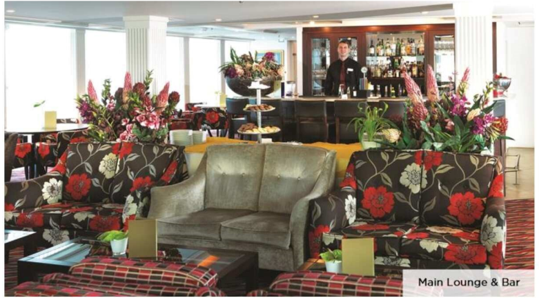
Main Lounge & Bar