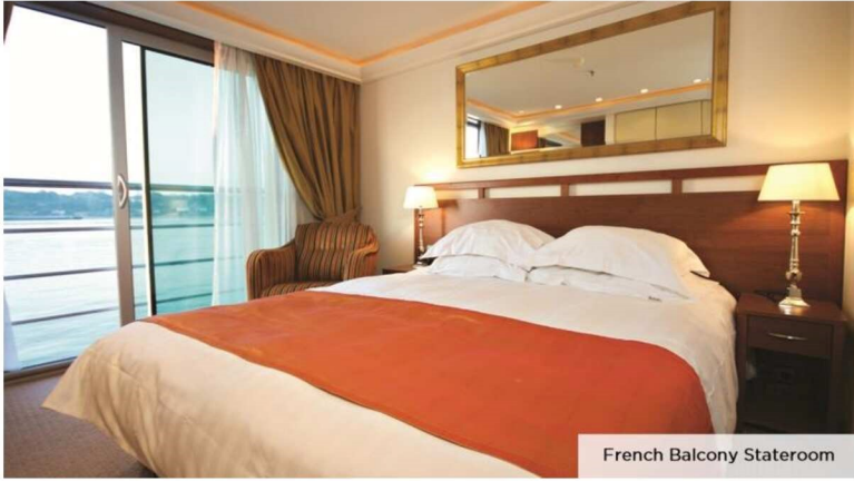
French Balcony Stateroom

7-night cruise | June 19-26, 2025 | Aboard AmaCello